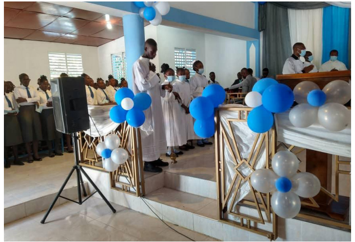
The Church of the Immaculate Conception, Chauffard

cloth face masks, reading glasses, chewable and adult vitamins, Tums, pain relievers, band aids, antibacterial ointment, hydrocortisone, toothpaste and tooth brushes, pencils and pencil sharpeners, and pens.